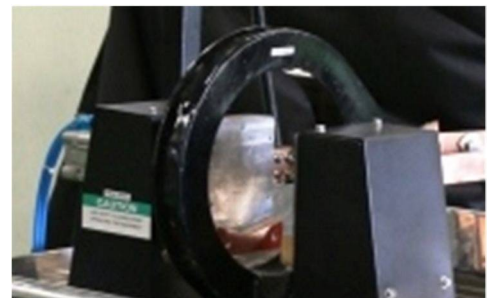
Clamping 250 mm Coil